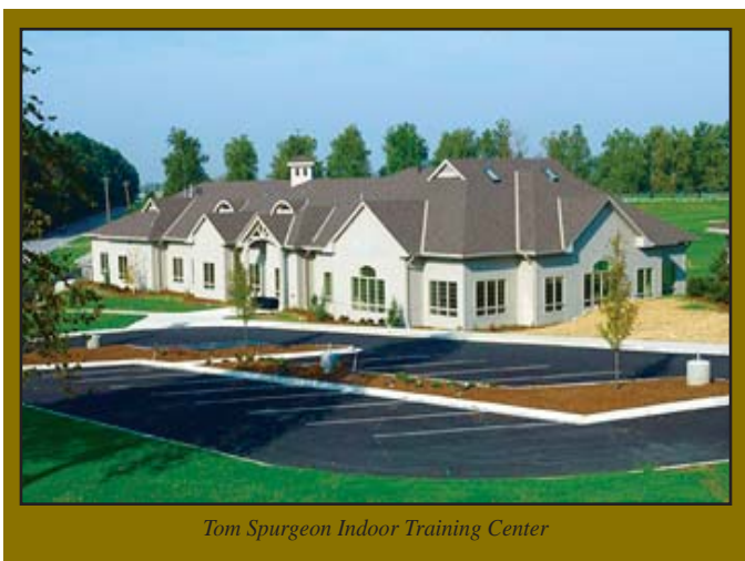
Tom Spurgeon Indoor Training Center